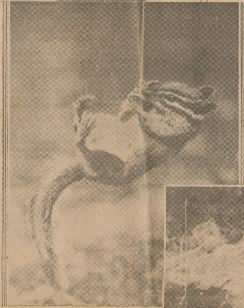
All feet and a furry tail off the ground.