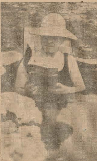
The author relaxes in the natural spring 'tub.'

A little later in the night I was awakened by a weird, unearthly chorus of quavering howls that echoed and re-echoed from the woods above the lake. The coyotes were afoot, threading the dark paths of the