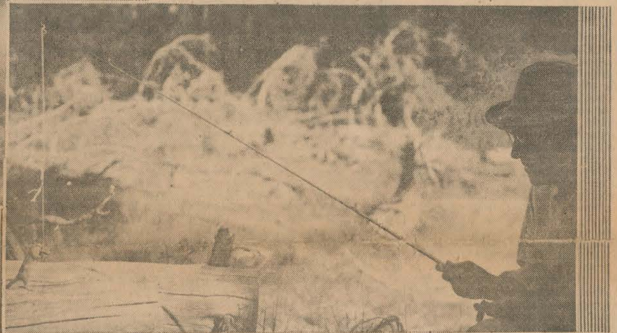
Curiosity and prospect of something to eat overcame chipmunk suspicion, but it required patience on part of 'anglers.'

Edna was turning the crisp, brown cakes which disappeared all too fast. A big bowl of syrup went with them. Aggravating fumes from a steaming coffee pot filled the air. On one of the little gasoline stoves a big skil-