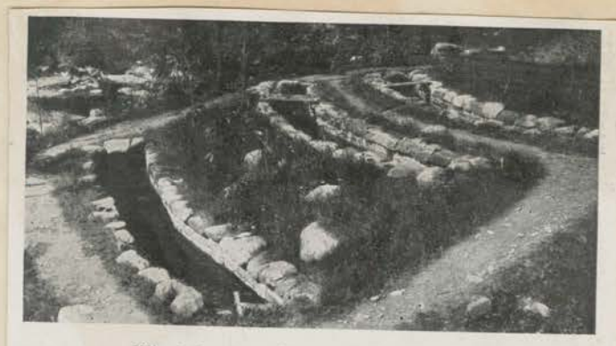
What trout could resist growing in pools like thes withal? Views of pools in Great

And the work still goes on and the wonderful accomplishment of the Waltonians has caught the interest of Major J. Ross Eakin, superintendent of Great Smoky National Park. In a beautiful wild gorge through which tumbles Little Pigeon River he is establishing one of the most modern batteries of holding ponds extant. As an emergency conservation project, the chapter in cooperation with superintendent Eakin, secured materials costing $1,717.41 to build ten pools that conform to park landscaping. Besides supervisory costs of $972.52, some 2,520 man days of CCC labor went into this construction program.