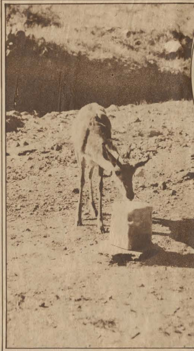
A PRESENT FROM THE NATIONAL PARK SERVICE: A YOUNG BUCK PRONGHORN ANTELOPE Licks a Block of Salt Left by the Rangers in the Grand Canyon.