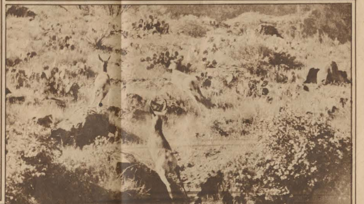
A SPECIES ALMOST EXTINCT WHICH HAS BEEN REINTRODUCED BY THE NATIONAL PARK SERVICE: A GROUP OF ANTELOPE, Which Formerly Roamed Over the Southwestern States, Running From the Camera at Indian Gardens on the Bright Angel Trail.