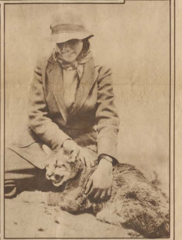
PHOTOGRAPHING A SURPRISED "SITTER": THE COUGAR