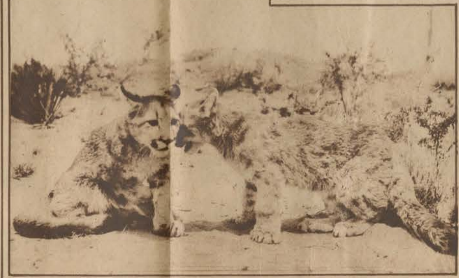
THE YOUNGEST MEMBERS OF THE FAMILY: TWO 6-MONTH-OLD COUGAR KITTENS Photographed at Play.