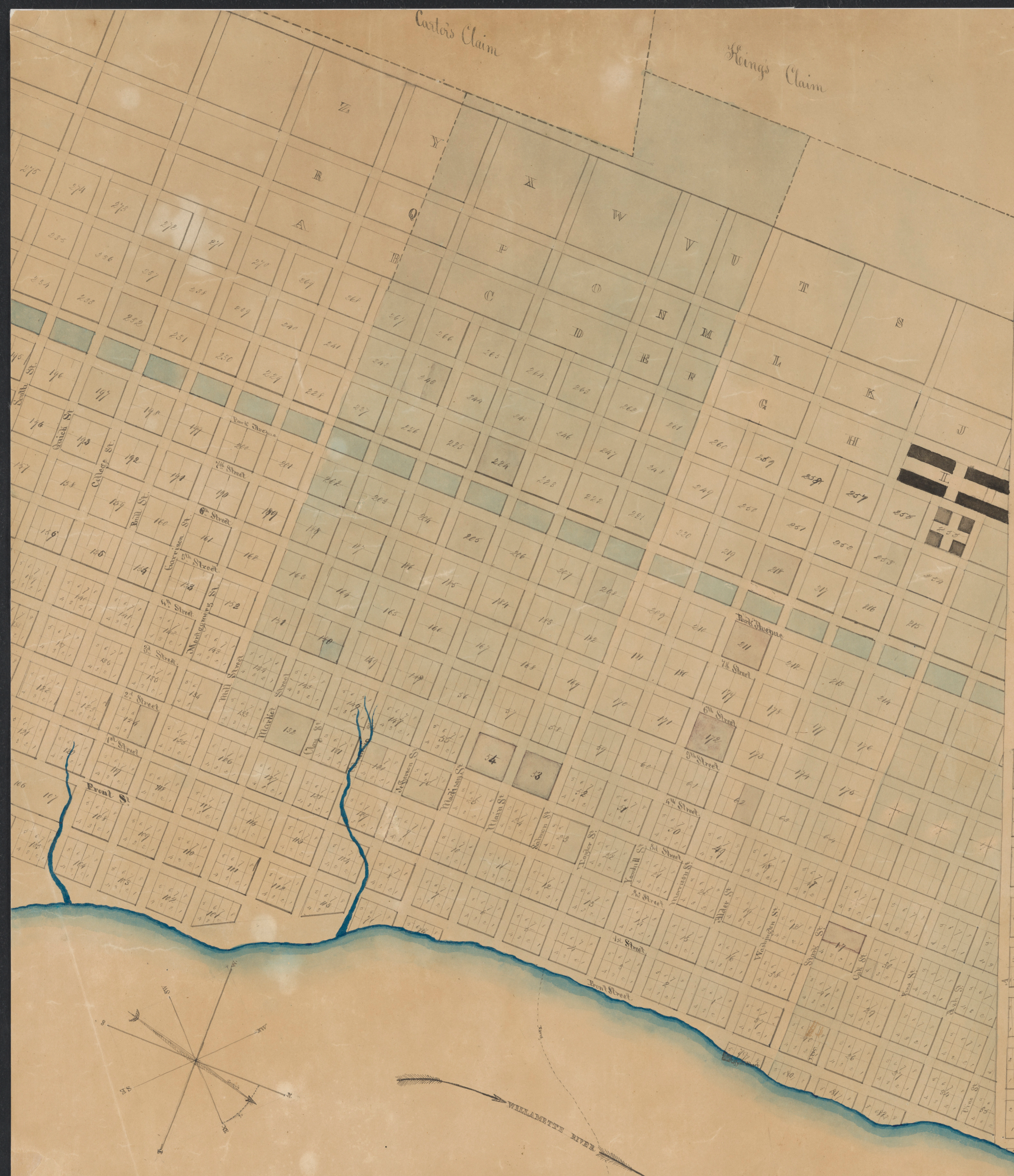
Plan from a survey by Captain T. O. Travailliot 1853